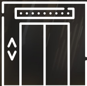
ELEVATOR HELP PHONES