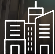
BUILDING HELP POINTS