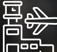
AIRPORT HELP POINTS